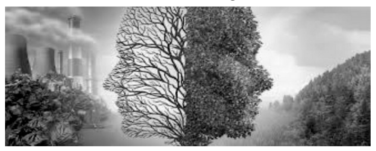
Theme: Get Up! Stand Up! Speak Up!: Intersecting with the Environment Scriptural Reference: Genesis 1:1-3 1 Scriptural Focus: Genesis 1:27-28 NIV

So God created mankind in his own image, in the image of God he created them; male and female he created them. God blessed them and said to them, "Be fruitful and increase in number; fill the earth and subdue it. Rule over the fish in the sea and the birds in the sky and over every living creature that moves on the ground." (Genesis 1:27-28 NIV)